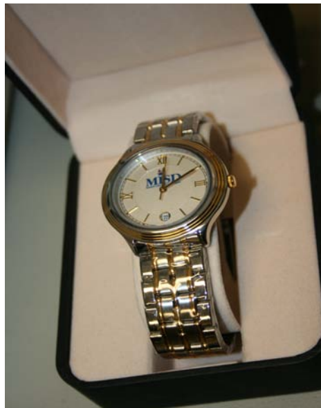
Example of ladies watch.